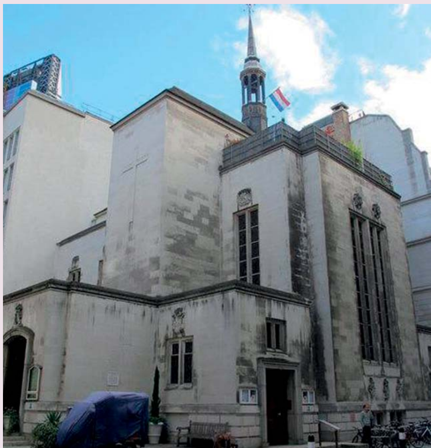
The Dutch Church in Austin Friars

It tells a lot about our rich history that we want to keep alive. We want to share our heritage with the Dutch community as well as with our City neighbours. But the Dutch Church is not only about the past. Today we are a progressive oecumenical church, the only church in England that conducts same sex marriages. On July 7th we will hold a 'pink' service in our church celebrating diversity. With our Dutch Centre we bring Dutch Culture to the City. We have our Low Countries Film festival, a Dutch Comedy Night, and we invite